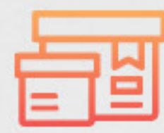
Safe & Attractive Packaging