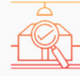
Vigilant Quality Assurance Department