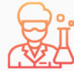
Highly Trained Technicians