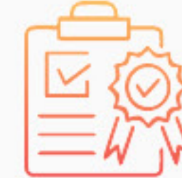
Quality Control Staff