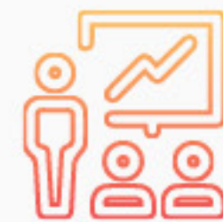
Experienced Sales Staff