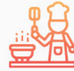
Qualified Food Experts